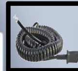
Headset Connecting Cords