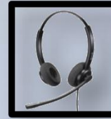
Call center headsets